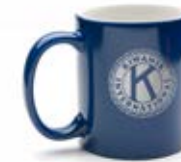
Seal as a graphic: Set straight. No tilt.