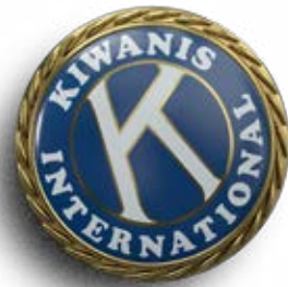
Preferred 15° left-leaning angle