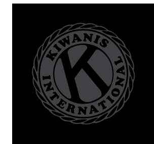
90% black normal